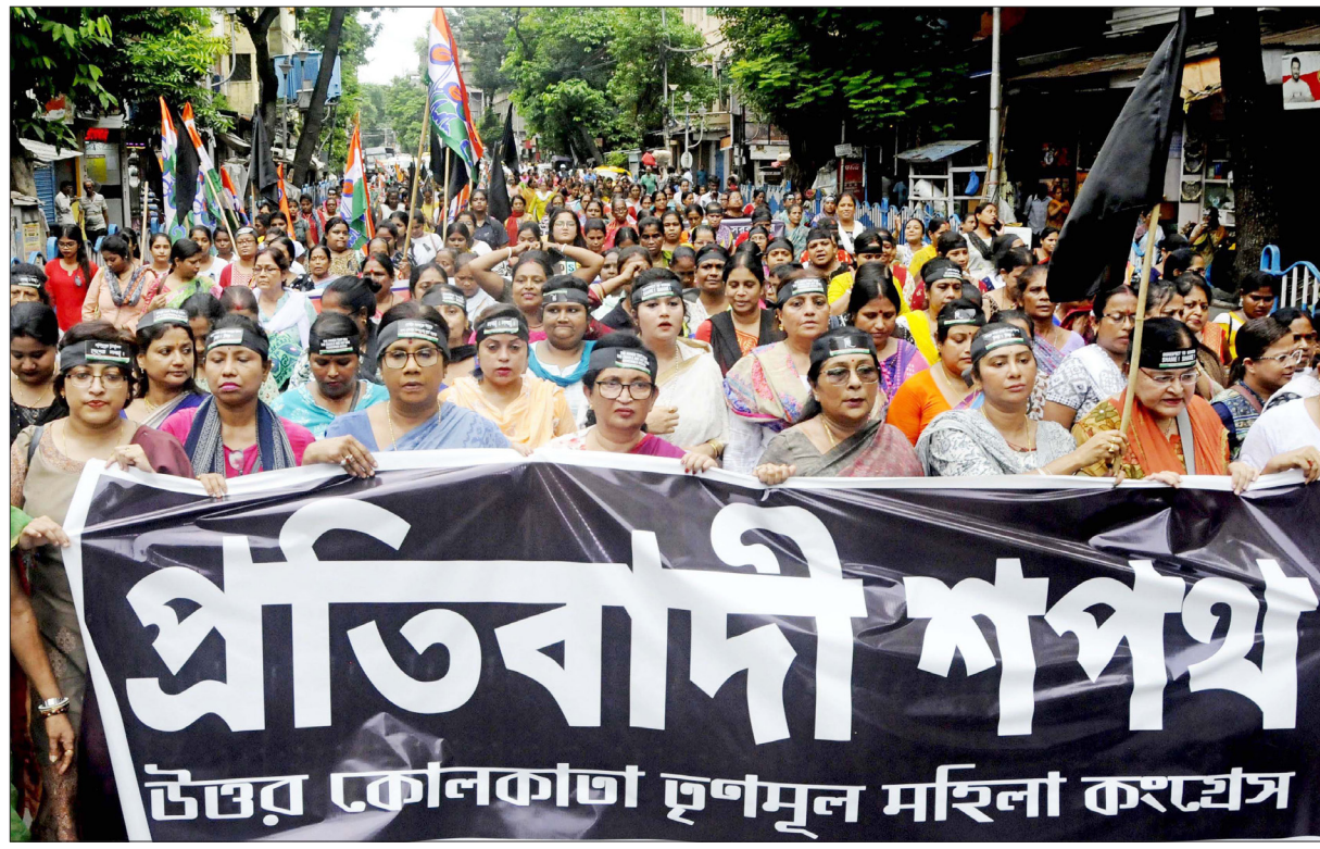
TMC's women wing's leader and activists take part in protest rally against violence on women in Manipur, in Kolkata on Friday.